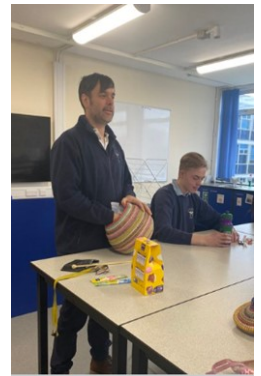
CLASS 7 LENTEN APPEAL RAFFLE WIN AN EASTER EGG - LOTS OF PRIZES