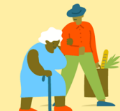
Perform acts of kindness