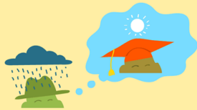
Recall positive life events